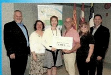
Campaign – unveiling