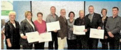
Campaign – launching